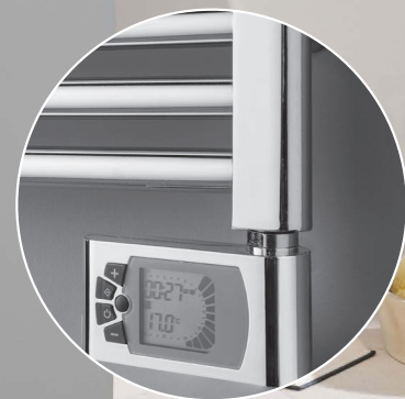
Electric Chrome option

1210mm x 500mm in White RAL 9016 with White Cylinder valves