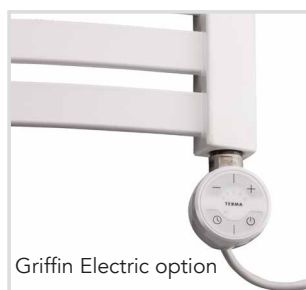
Griffin Electric option