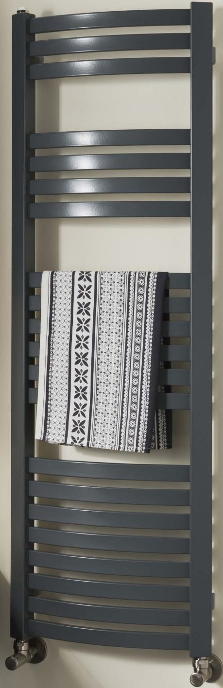
1220mm x 400mm in RAL 7012 with Nickel Cylinder Valves