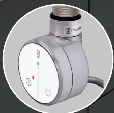
Dual Fuel options see pages 114-115