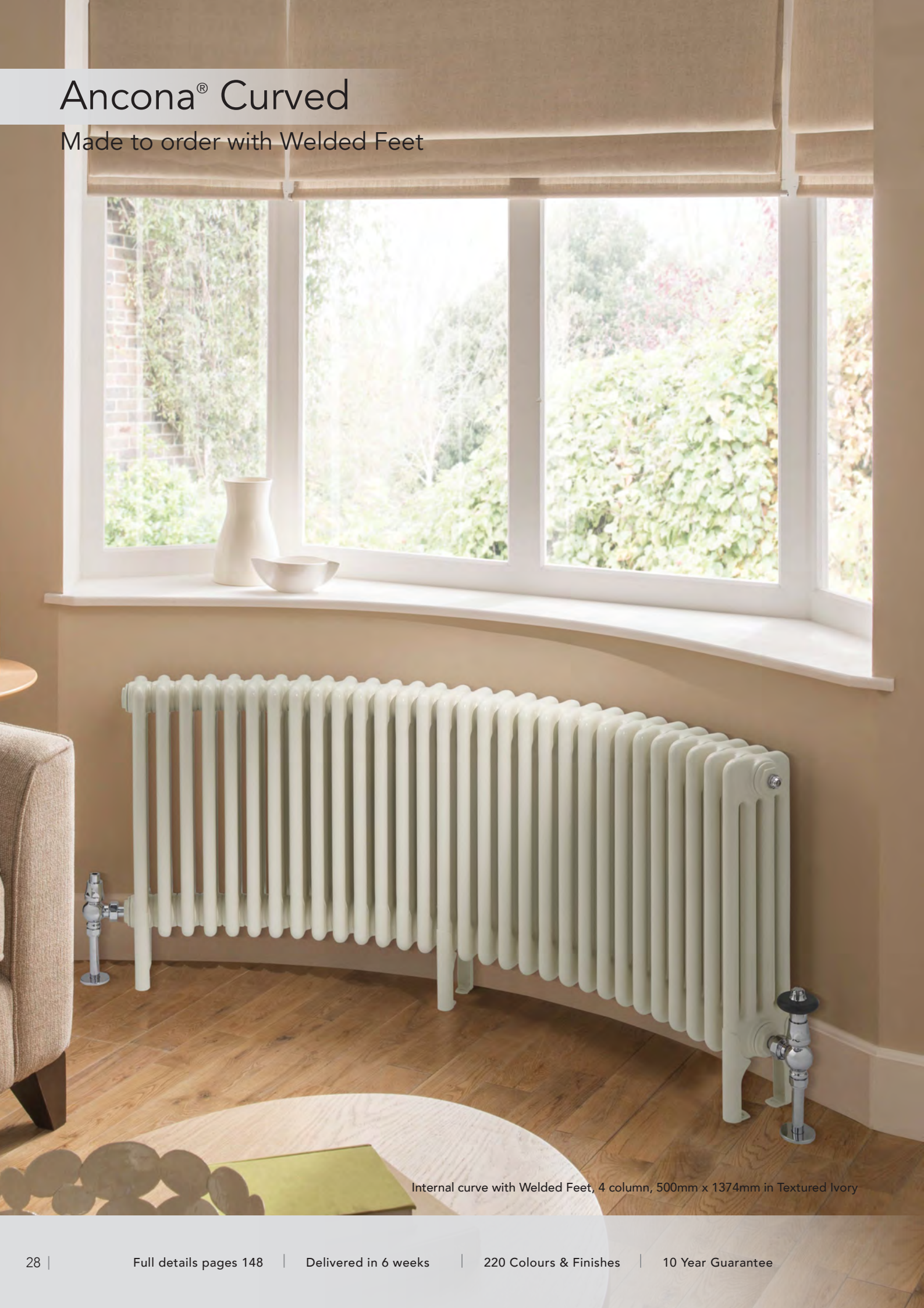
Internal curve with Welded Feet, 4 column, 500mm x 1374mm in Textured Ivory