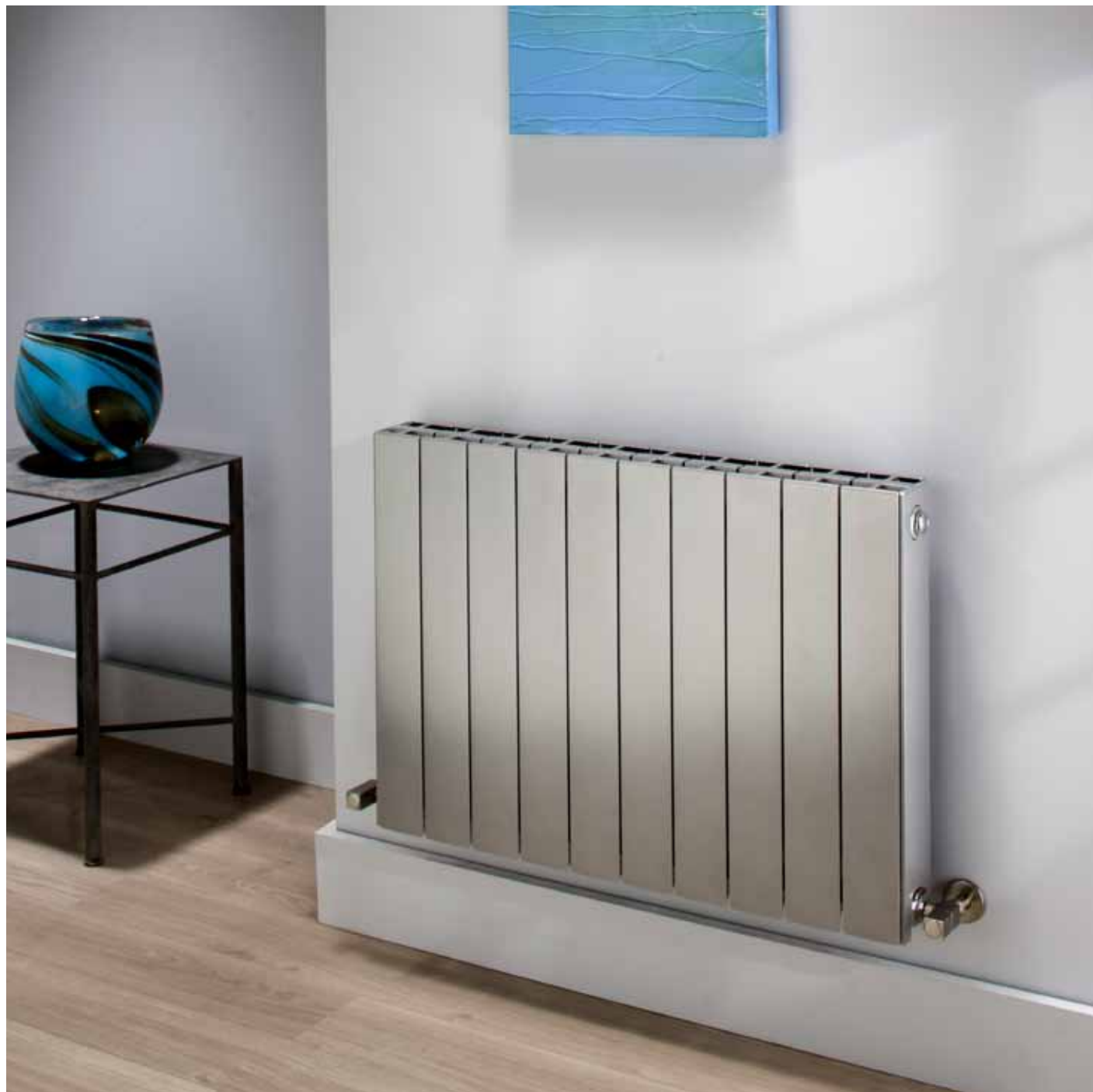
Vip Royale 690 x 800 shown in Polished Silver with Mini Cube valves.

We have given our stock white aluminium lines (Vip & Oscar) the royal treatment. With 4 striking powder coated special finishes and fitted with end panels as standard, these models have all the benefits of Aluminium's thermal properties giving them great outputs and fast response to changes in temperature; as well as a unique designer style.