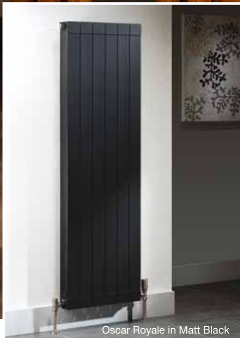
Oscar Royale in Matt Black