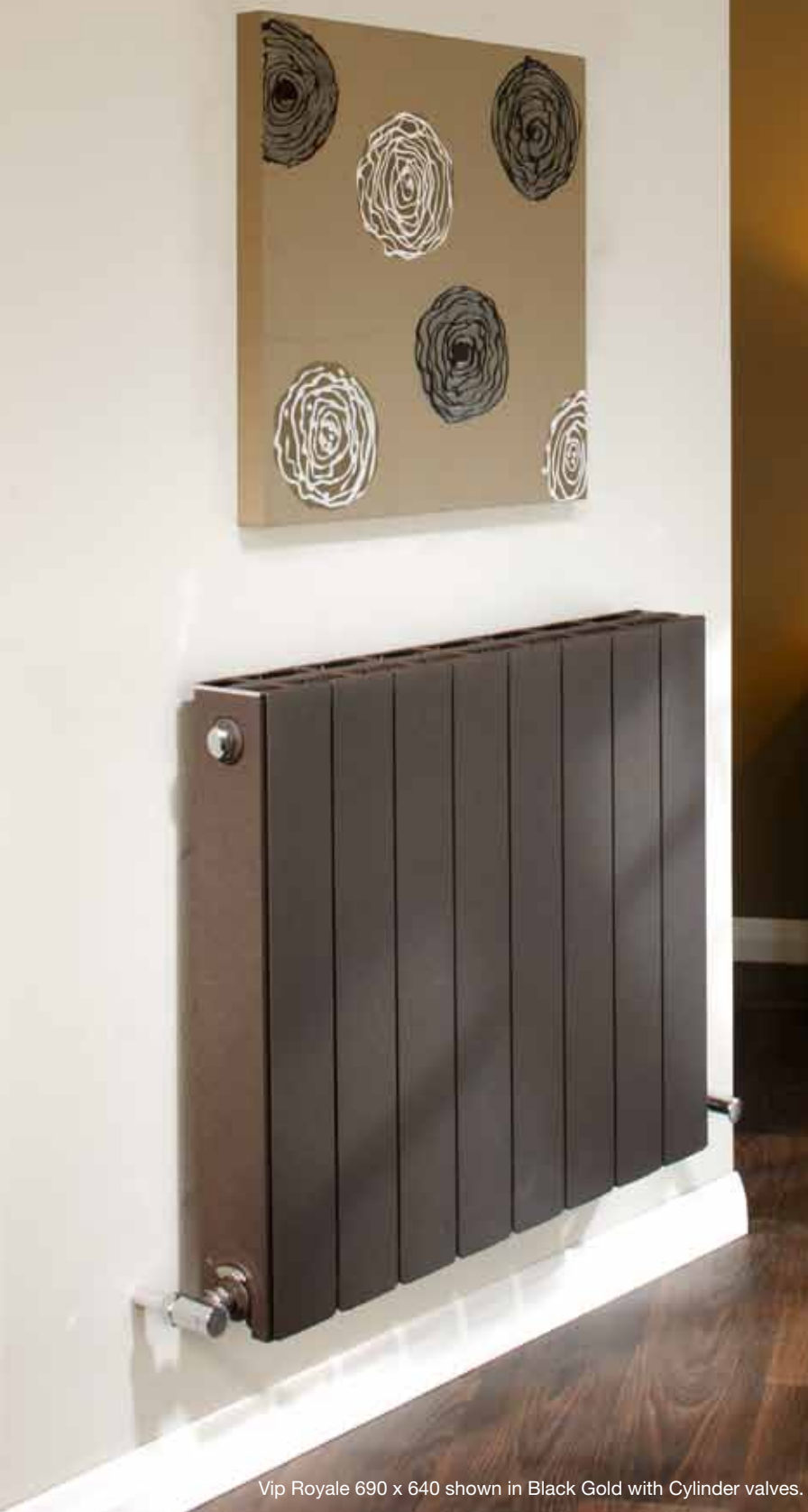
Vip Royale 690 x 640 shown in Black Gold with Cylinder valves.