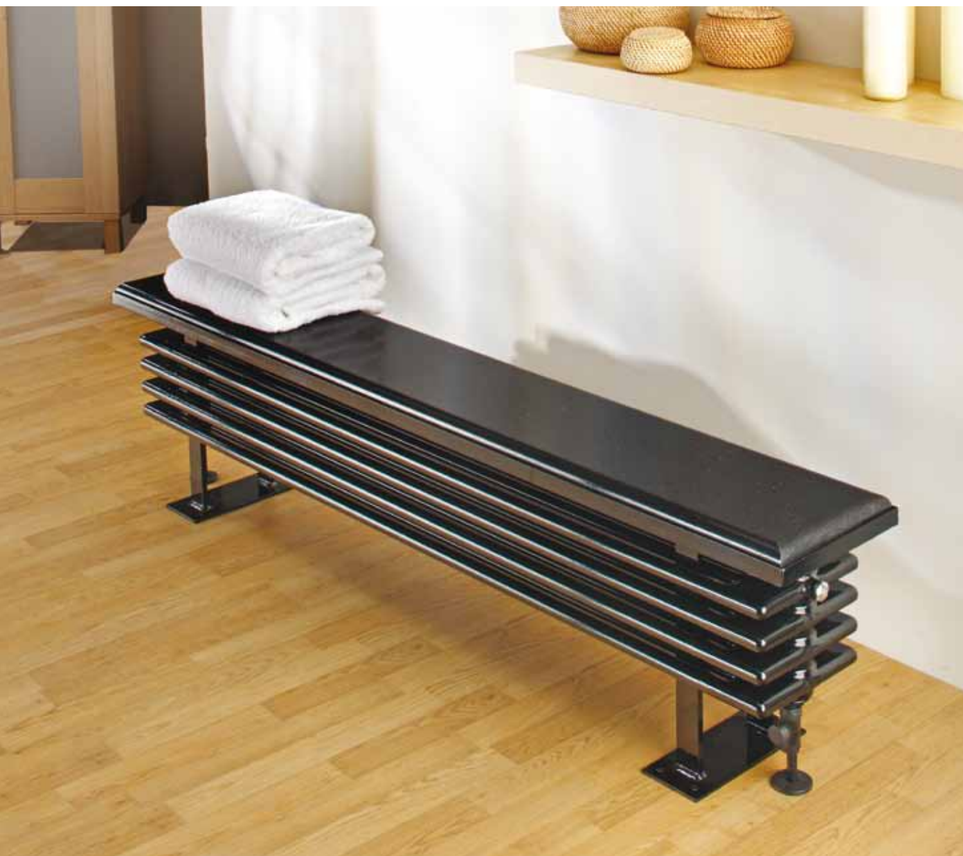
Ancona Bench Seat 6 Column, 388 x 1300, shown in RAL 9005 with example of black granite seat (not included).

The Ancona bench seat is perfect in boot rooms or in games rooms, providing a dual purpose solution. The Bench seat is provided with an open frame top so that you can match your finished seat to suit your interior scheme.